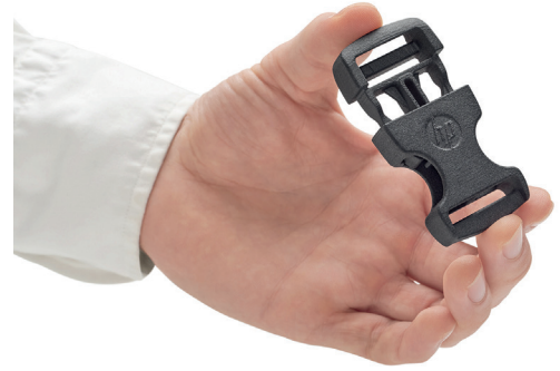
Figure 3: HP 3D HR PA 11 part courtesy of NACAR

The mechanical properties of HP 3D HR PA 12, HP 3D HR PA 12 GB, and HP 3D HR PA 11 in the HP Jet Fusion 4200 3D Printing Solution and the HP Jet Fusion 5200 Series 3D Printing Solution have been characterized in the HP 3D Printing materials for the HP Jet Fusion 4200 3D Printing Solution – Mechanical Properties and HP 3D Printing materials for the HP Jet Fusion 5200 Series 3D Printing Solution – Mechanical Properties white papers, respectively.